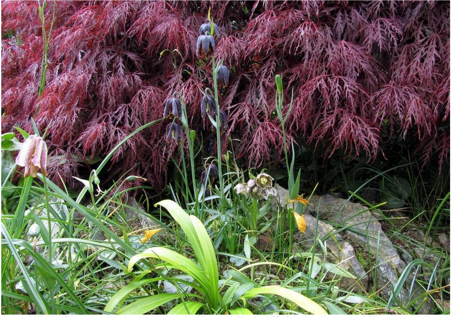
Fritillaria flowering in the sand beds include Fritillaria affinis tristulis and Fritillaria purdyii.