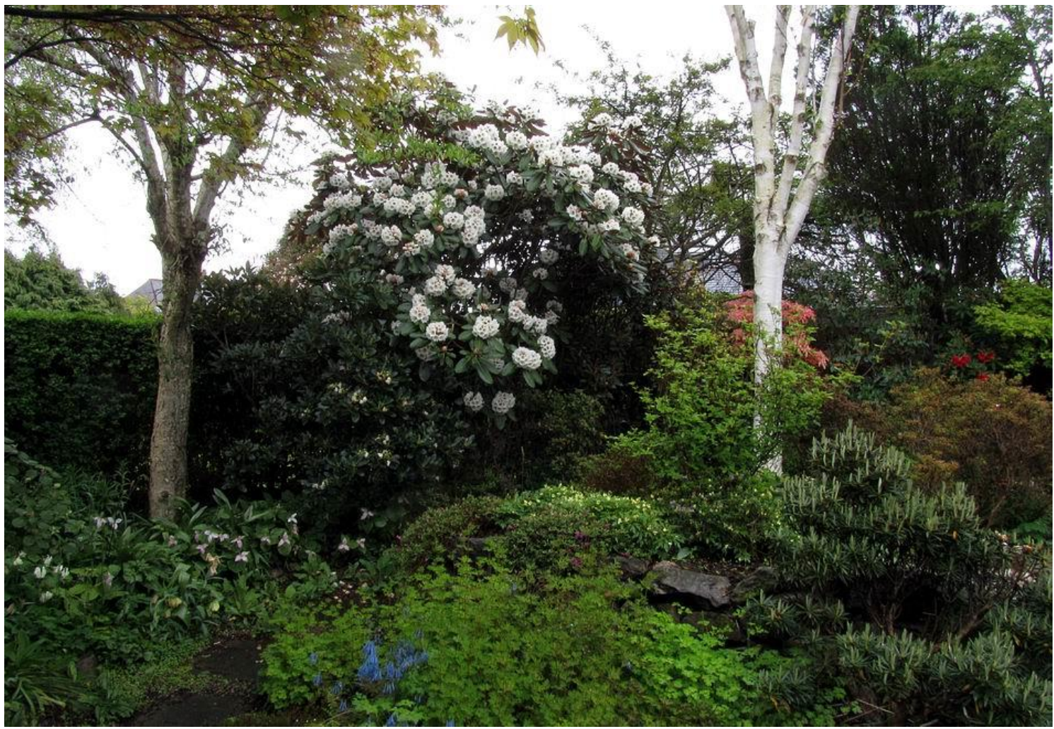
Here is a view showing the scale - at 3-4 meters tall it is more of a small tree than a bush.