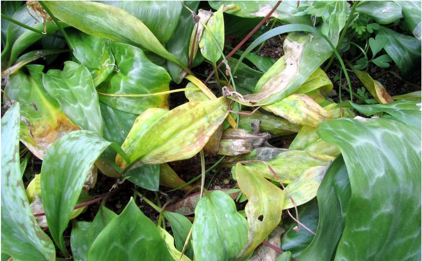
With the prolonged wet conditions these moulds grow and can kill off the leaves. While this is highly undesirable, provided you remove the dead leaves to help prevent the moulds going down to the bulb, these plants will only suffer a slight shortening of the growing period and I would still expect them to flower again next year.

The cold wet weather does bring problems especially where the Erythroniums are so densely planted as they are in our plunge beds. As the petals fall they attract grey moulds which, if in contact with the leaves, will pass on the infection.