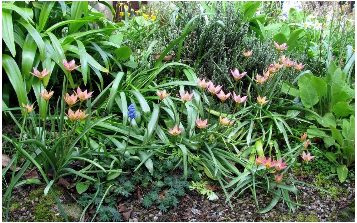
Tulipa humilis is another one that increases year on year growing here in our rock garden bed. I am always hoping that I will get some seed to set in the garden so that I can start to shift their tolerance towards our garden conditions unfortunately again we have had a cold wet period while they are in flower and that is not conducive to seed set.

I do like tulips and have been trying to grow them for many years - they are after all one of the closest relatives to Erythronium. The main difference being that Tulips have evolved in generally hotter drier climatic regions so their flowers can look upwards while Erythronium colonised wetter climatic regions bowing their heads to protect the reproductive floral parts. The narrow south facing bed at the base of our kitchen wall is where we try many of Tulips and some do manage to cope with our weather. The majority of the flowers above are Tulipa batalini which even manages to increase each year.