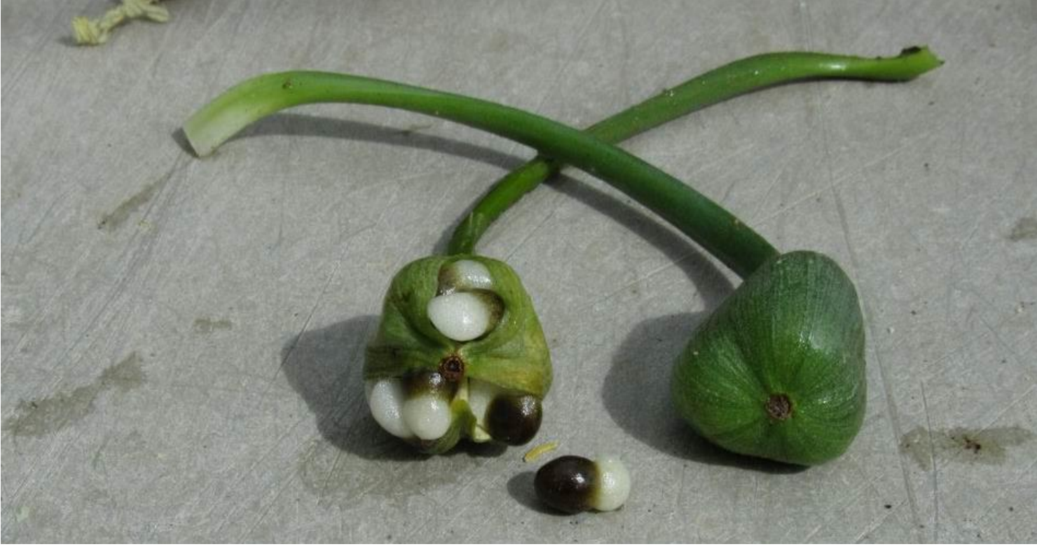
Fully ripe Sternbergia sicula seeds bursting out of their capsule.