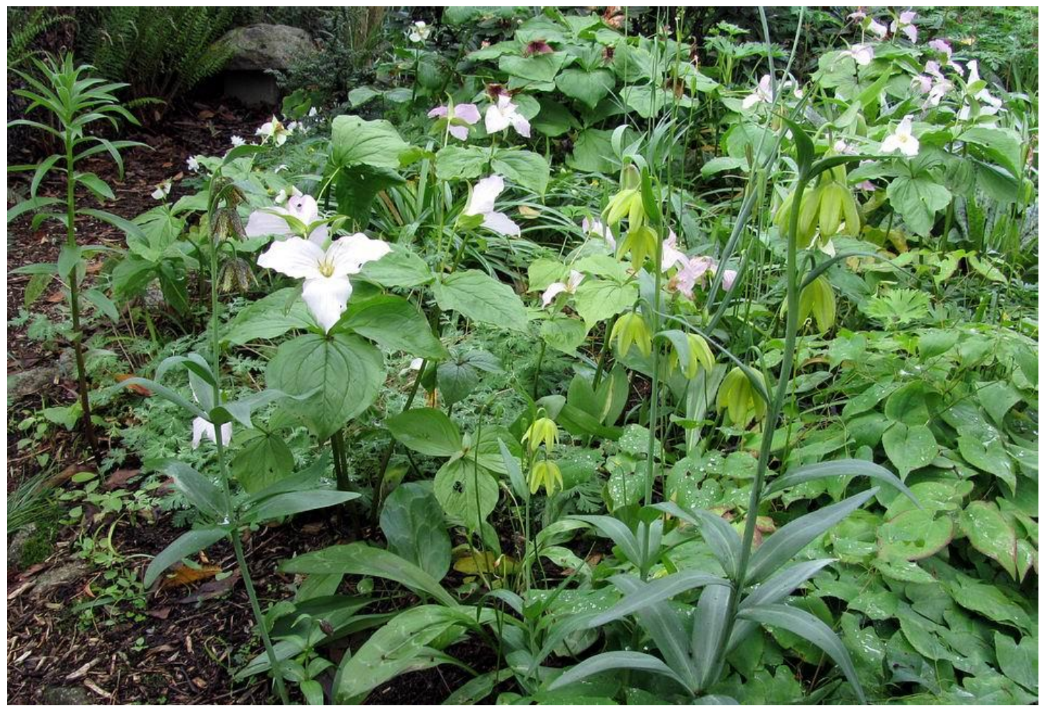
Fritillaria affinis and its yellow form along with Trillium grandiflorum.